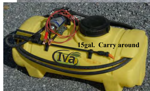
15gal. Carry around

Base unit, add pump, and optional handgun, hose, or booms.