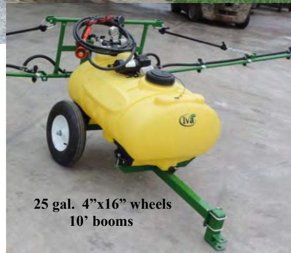
25 gal. 4" x 16" wheels 10' booms