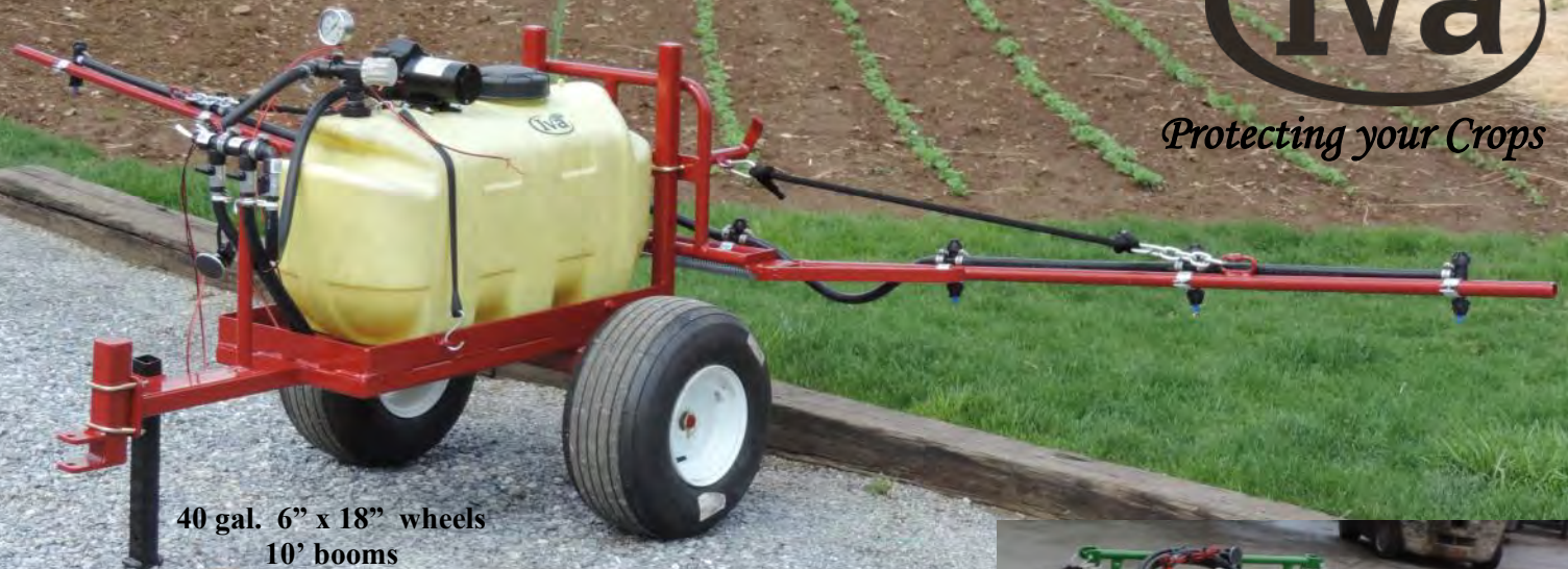
40 gal. 6" x 18" wheels 10' booms