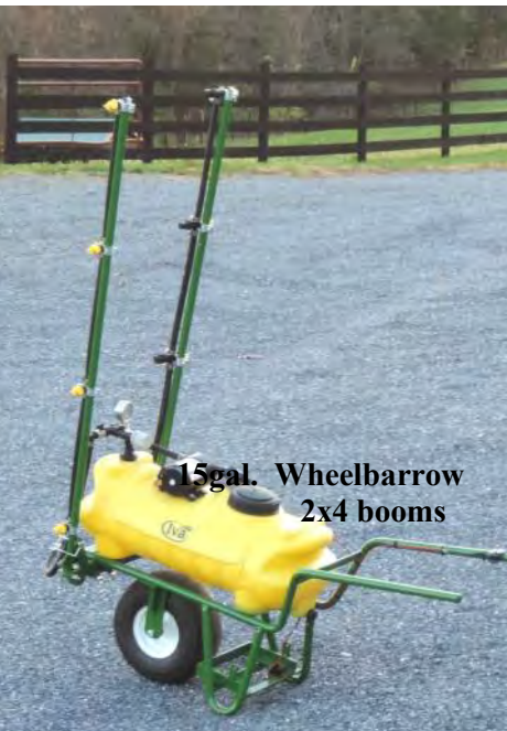
15gal. Wheelbarrow 2x4 booms