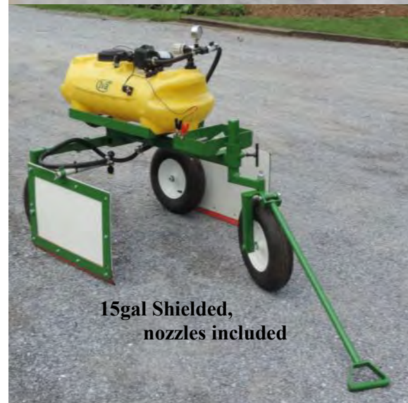
15gal Shielded, nozzles included